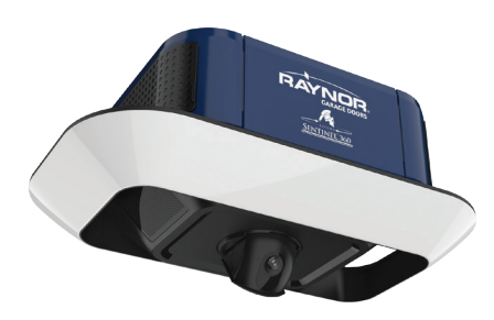
Raynor Sentinel<sup>™</sup> 360

Raynor's full line of residential openers offer a broad selection of performance, features and durability. All models offer the ultimate in safety and security features, are available in a variety of horsepower levels and drive systems, as well as wall mounted jackshaft operators and battery backup systems. MyQ™ technology enables you to securely monitor and control your garage door opener with your smart phone, tablet or computer.